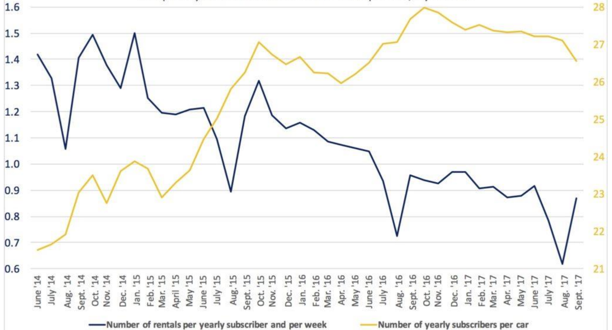
Frequency of use vs. Number of users per car, by month